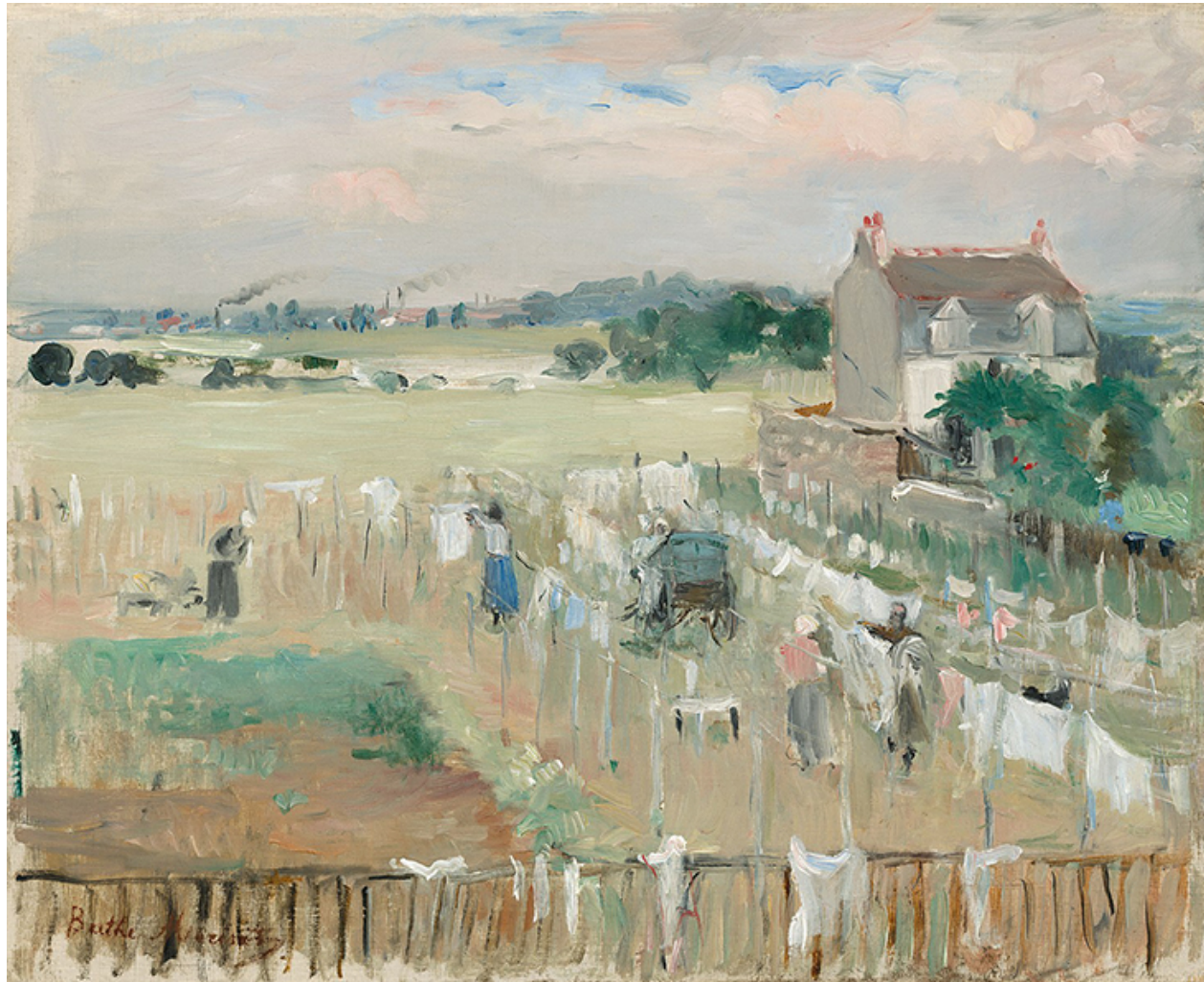
Berthe Morisot, Hanging the Laundry out to Dry, 1875