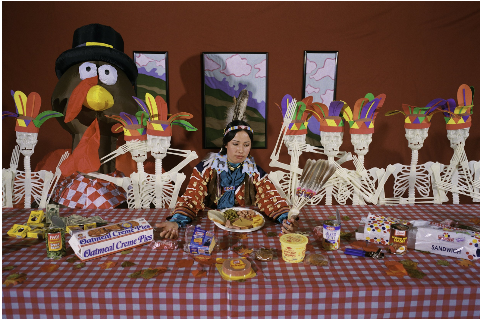
Wendy Red Star, The Last Thanks, 2006