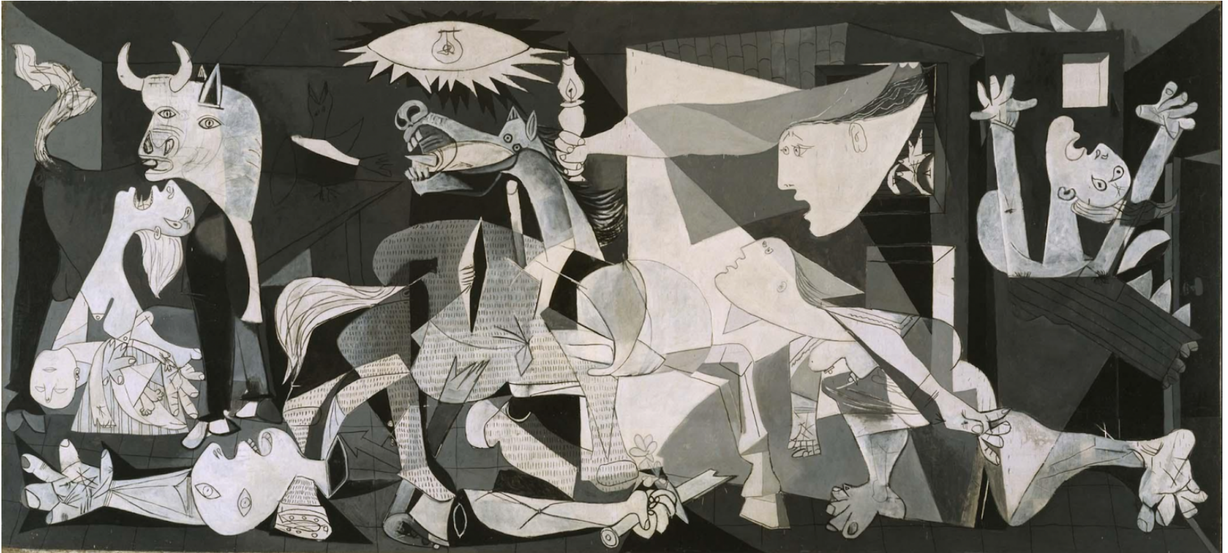
Pablo Picasso, Guernica, 1937