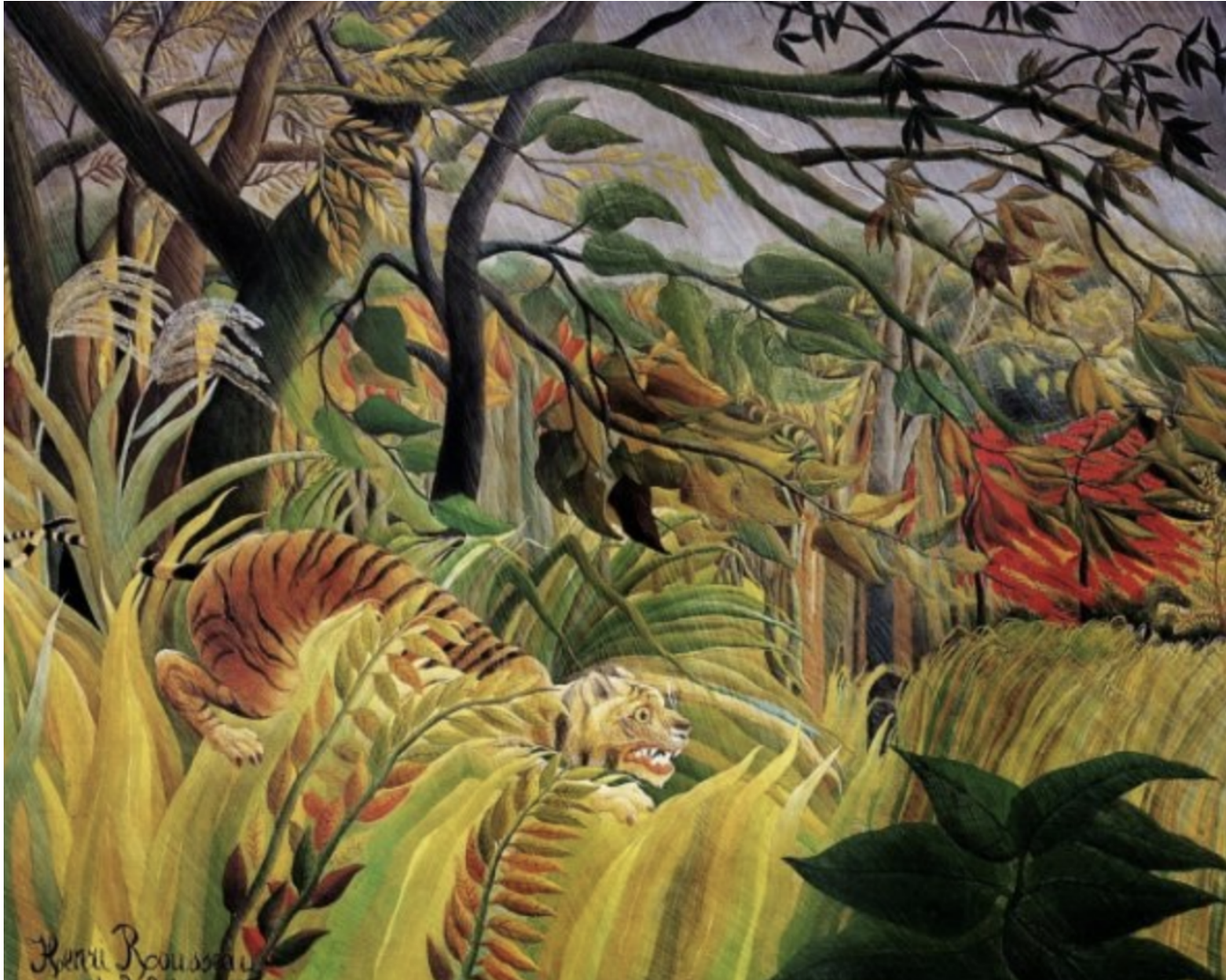
Henri Rousseau, Tiger in a Storm or Surprised!, 1891