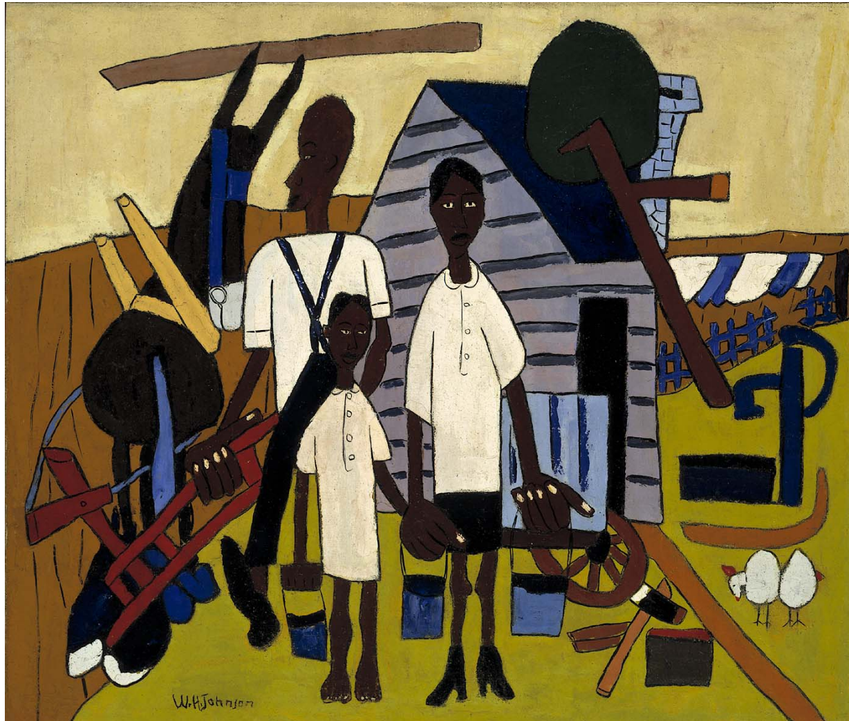
William H. Johnson, Early Morning Work, 1940